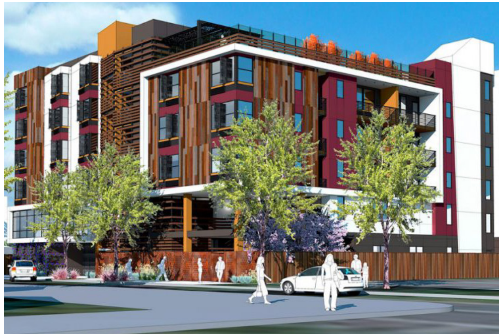
An artist's rendering of Villas on the Park, which is scheduled to open in downtown San Jose. The San Jose City Council hopes to provide more affordable housing like this development for its most vulnerable residents.

In California, we do things differently. Here land being zoned for a particular use is just the start of an excruciating permitting process which might, possibly, result in a house being built some years later. Don't bet on it though – as NIMBYs will put up a fierce fight against any home building.